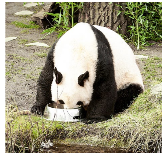
Giant pandas Yuan Yuan and Yang Yang in Vienna Zoo, Tiergarten Schönbrunn

Before contacting ANDRITZ, the zoo was grating and refining bamboo using a small,