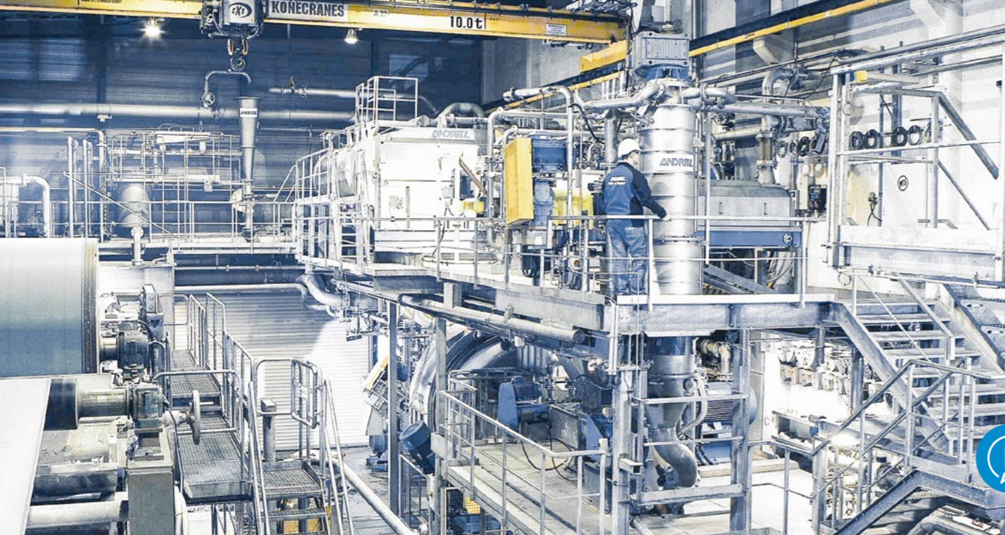
At the Stock Preparation Pilot Plant in Graz, papermakers have the possibility to test their ideas on a pilot scale and simulate paper mill conditions – regardless of whether a certain single piece of equipment or a complete line in different setups is being tested.