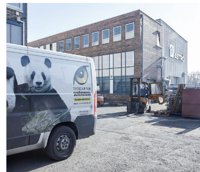
Arrival of pre-shredded bamboo