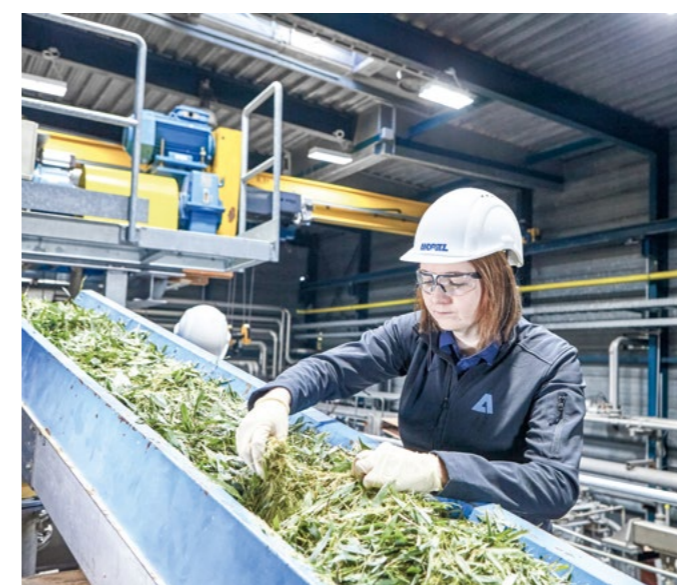
The shredded bamboo was sent to the Stock Preparation Pilot Plant in Graz where it was successfully processed using a CompaDis disperser.

Liukkonen says, "This is a very special place here in Graz where new raw materials or process configurations can be tested in a risk-free environment prior to investment commitment. Customers can see the benefits of a new concept themselves in realistic process conditions before taking the decision.